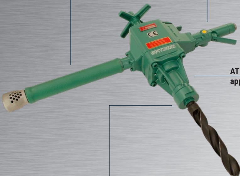
ATEX-Safety class approved