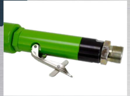
Safety lever valve or safety twist throttle