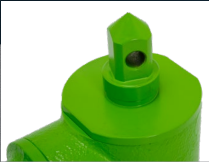
Feed spindle with centering