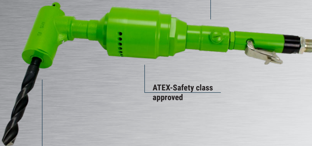
ATEX-Safety class approved